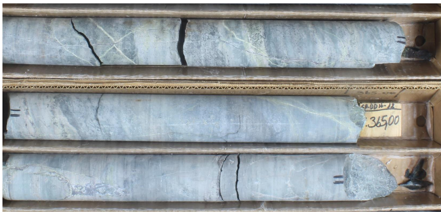
Hole SP-DDH-12, 364.00m to 365.50m. From a 56 m interval of andesite with various intercepts with chlorite-actinolite-epidote and disseminated magnetite-chalcopyrite-pyrite.