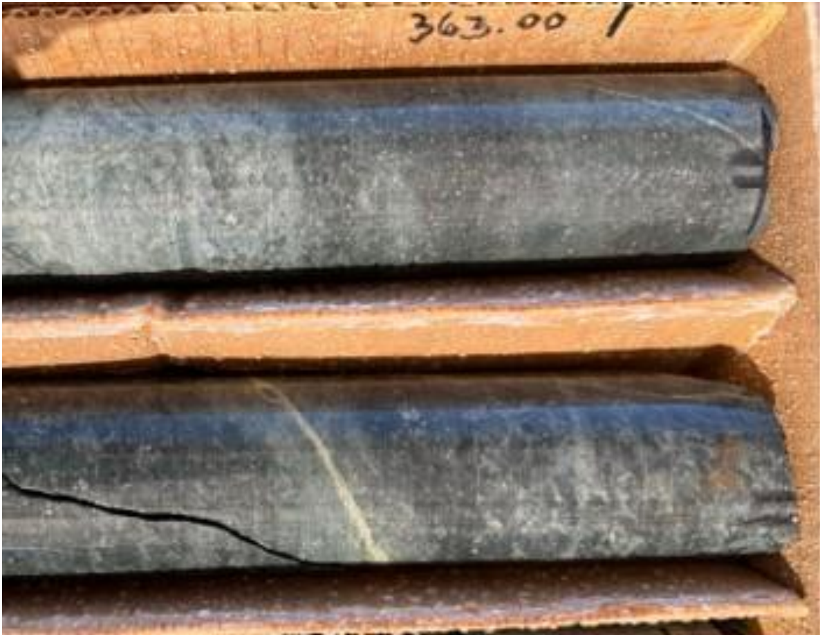
Hole SP-DDH-12, at 363 m. Disseminated chalcopyrite and pyrite. From within a 56 m interval of andesite with various internal intervals of chlorite-actinolite-epidote with disseminated magnetite-chalcopyrite-pyrite.