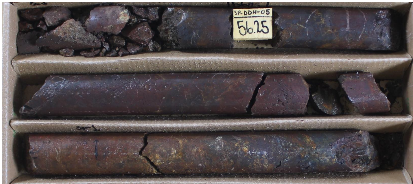
Hole SP-DDH-05, 56.00 to 57.30m. Part of an interval from 51.45 m to 57.55 m of mantos with an estimate 80% of magnetite-martite.