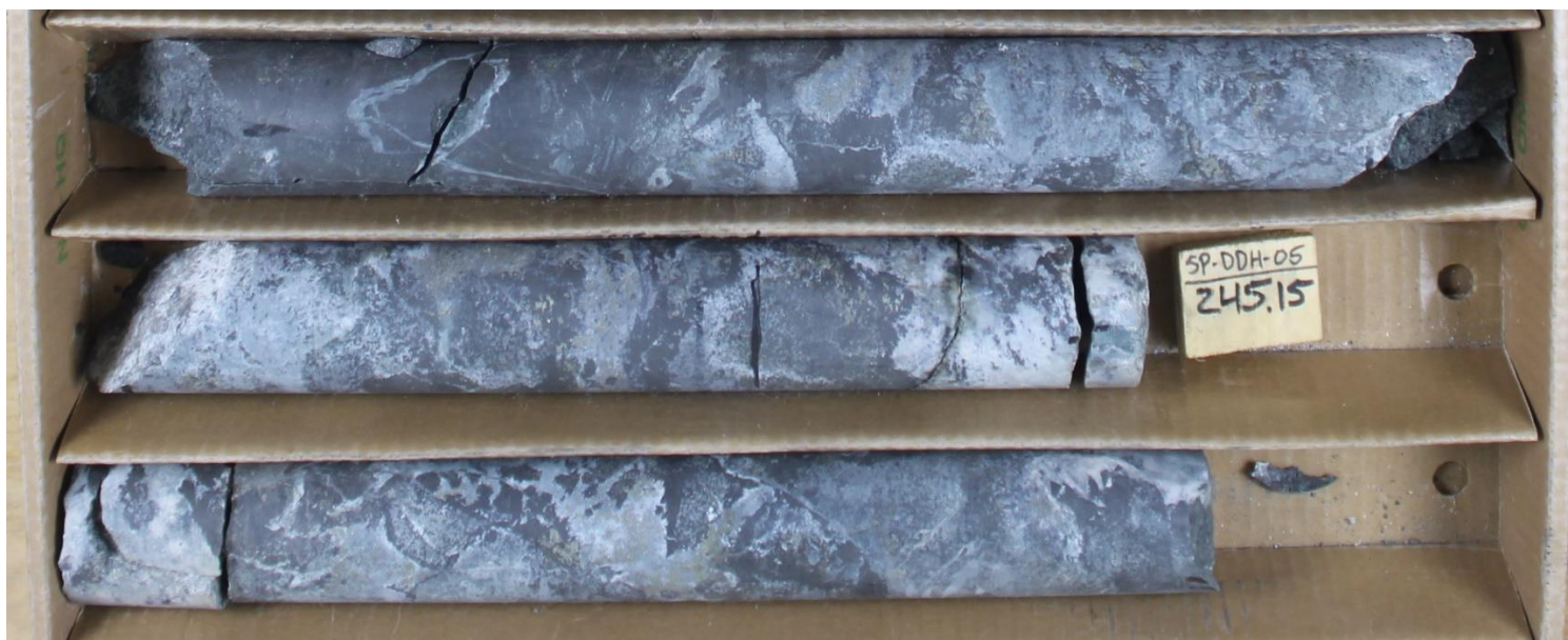
Hole SP-DDH-05, 242.02m to 245.62m. magnetite replacement with quartz-scapolite and pyrite-chalcopyrite. Part of a wider interval from 235.70m to 253.55 m.